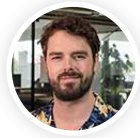
Stijn van Wonderen