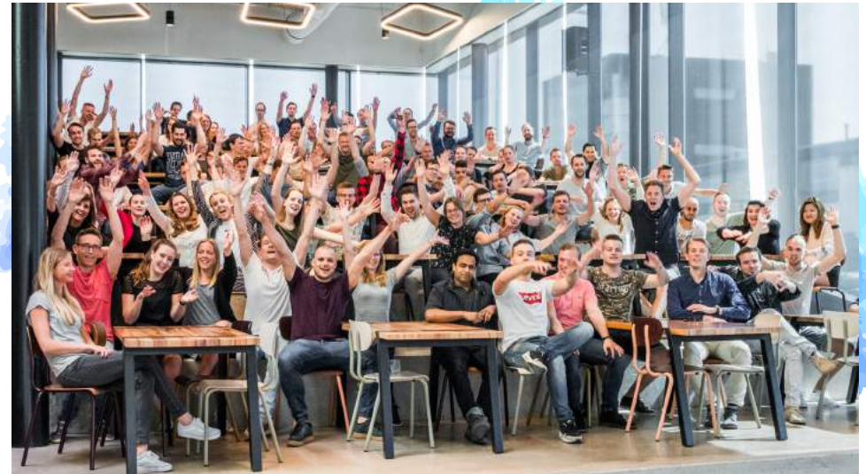
Greetings from the team!